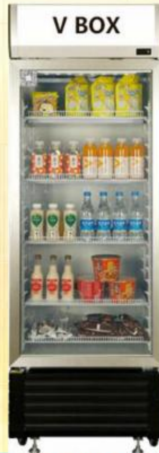
Smart vending cabinet