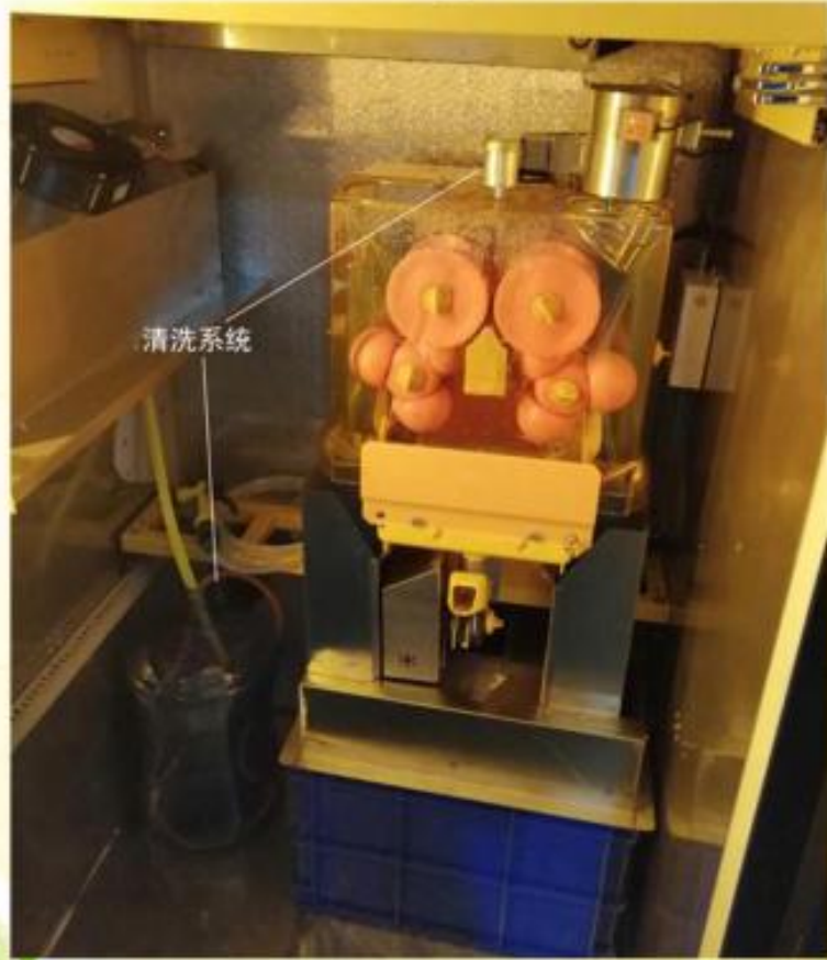
Smart Clean system