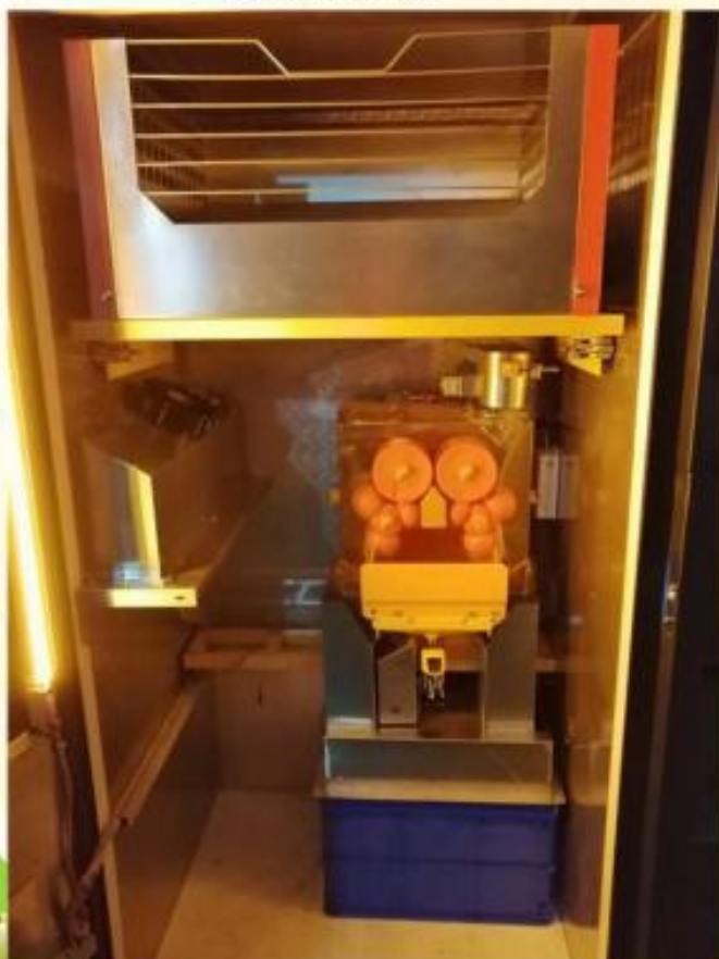
Capping type machine